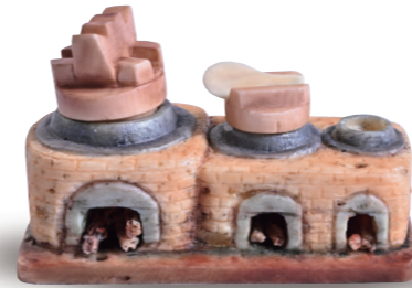
『 Kitchen Stove 』 JIN (1956~) H3.2cm

In this work, the rice bales symbolize a bountiful harvest, while the mice represent the wish for a prosperous lineage.