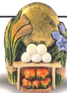
『Harvest Moon』 JIN (1956~) H4.2cm It is a custom to admire the most beautiful moon of the year and celebrate the autumn harvest. In 2025, it falls on October 6th.