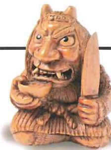
『Namahage (ogre)』 KINSUI (1926~) H4.0cm The red ogre of Namahage is considered the Grandfather Ogre. On New Year's Eve, he walks around shouting, "Are there any bad kids?"