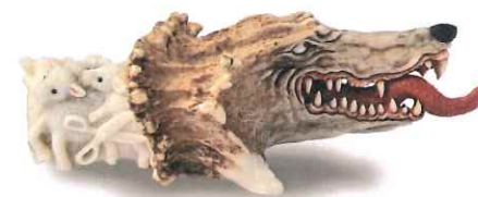
『Wolf and Kid』 KIHIO (1957~) H2.4cm From the Grimm's Fairy Tale "The Wolf and the Seven Little Goats." The moral is: never be fooled by appearances, and evil will always be defeated.