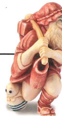
『Messenger Santa Claus』 IPPU (1970~) H6.4cm December is the peak of the Christmas shopping season. Back in the day, there might have been a Japanese version of Santa Claus.