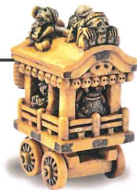
『Festival Out of Season』 ZANMAI (1967~) H5.0cm In this work, even if the skeletons recall the vibrant festivals of their past lives, it is all in vain.

The narrative form excels at explaining the passage of time and causal relationships. Furthermore, readers develop deeper empathy and trust toward the characters, stirring their emotions. It is also known that encountering emotionally resonant stories can heal the heart and enrich one's life. Such effects of storytelling are also utilized in netsuke. We will explore the relationship between these narratives and netsuke.