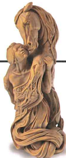
THE GOLDEN NETSUKES AWARDS GRAND PRIX 『Forms of "bond" in Folktales』 ITARO (1961~) H6.9cm The folktale tells of a tragic love between a horse and a maiden. The father beheaded the horse, but the maiden mounted its head and ascended to heaven.