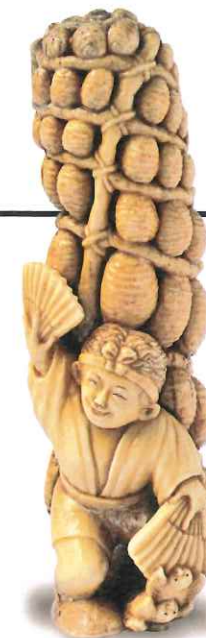
『Akita Kanto Matsuri』 DOSAI (1950~) H8.5cm This festival is held to ward off misfortune and pray for a bountiful harvest. The poles with hanging lanterns symbolize rice ears.