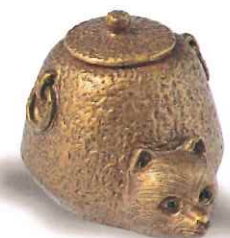
『Bunbuku Chagama』 AKIHIDE (1934~) H3.1cm From the tale of the teakettle transformed by a raccoon dog. Drinking this tea is said to bring blessings such as good fortune and a long life.