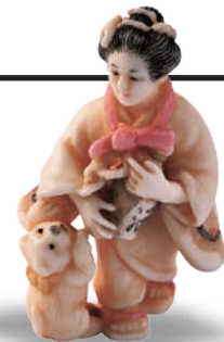
『 Festive Sake 』 TOSHI (1957~) H4.1cm The irregular shape of the accidentally formed eucalyptus mass was utilized to create a miraculous form.