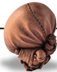
『 Hotei 』 KUKAN (1950~) H3.0cm The bag carried by Hotei, who helped many poor people, is filled with compassion and gratitude from everyone.