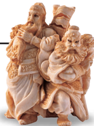
『 Vow Knot 』 TETSURO (1953~) H5.4cm A famous scene from the Three Kingdoms, where brothers-in-law are bound together under the peach.