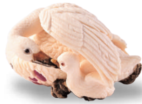
『 Passing the Winter -Starving and cold 』 KUKAN (1968~) H3.0cm The parrots symbolize family security and marital bliss, as the couple raises their chicks together.