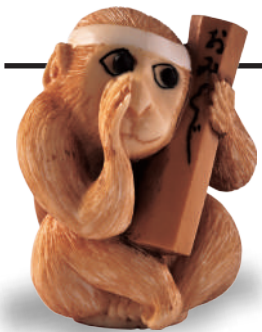
『 Betrothal 』 YUKO (1952~) H4.3cm The monkey is considered a symbol of marriage because it has the same sound as the Japanese word for marriage.