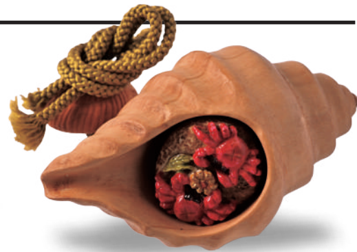
『 Seaside Poem 』 TAKESHI (1940~) H6.0cm On the seaside, two crabs whisper a love hymn amongst the reels, presenting flowers.