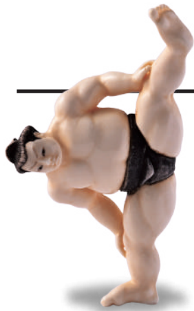
『 Stretching 』 KIHO (1957~) H6.1cm Before a match, sumo wrestlers perform a ritual in which one foot is lifted high and stepped onto the ground.