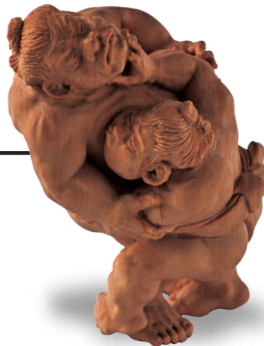
『 Final Bout of the Tournament Day 』 SEIHO (1937~2003) H6.5cm In the grand finale of a Sumo wrestling match, the remaining Sumo wrestlers fight with all their might.