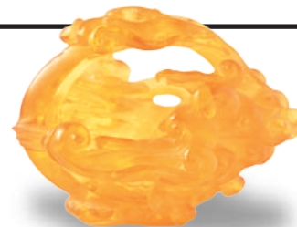
『 Crescent Moon 』 AKEMI (1959~) H3.1cm Boldly hollowed out of amber, the transparency and luster of the amber represent an ephemeral crescent moon.