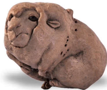
『 Knot 』 HIDEAKI (1979~) H4.4cm The irregular shape of the accidentally formed eucalyptus mass was utilized to create a miraculous form.