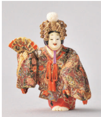
2. ISSYU 『Celestial Robe』 H5.3cm 1959

Special Exhibition for April to June 2025