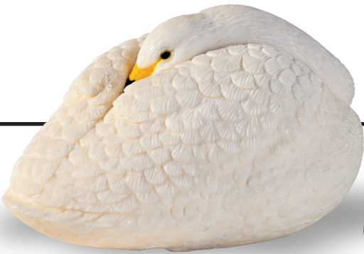
『 Late Autumn 』 KOZAN (1946~) H5.1cm On a mild day in early winter, think of the swans crossing the surface of the lake, glistening in the sunlight.