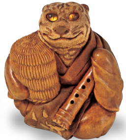
『 Komuso (Pilgriming Monk) 』 TOUN (1960~) H3.7cm The title is also taken from the personification of the tiger, which is a personification of the kumuso monk.