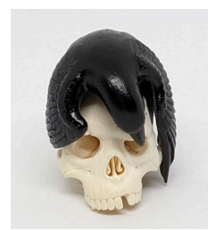
[Raven Embracing Skull] H4.5cm