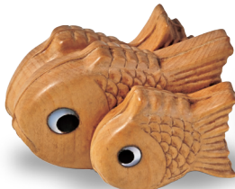
『 Happy Family 』 SETSUJI (1941~) H2.6cm Baked sweets in the shape of a sea bream are a typical Japanese confectionery. A happy parent and child taiyaki.