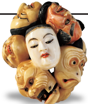
『 Noh Mask 』 ISSHU (1917~2017) H4.5cm A work with impact, carved from various Noh masks and combined into an ellipse, as is typical of netsuke.