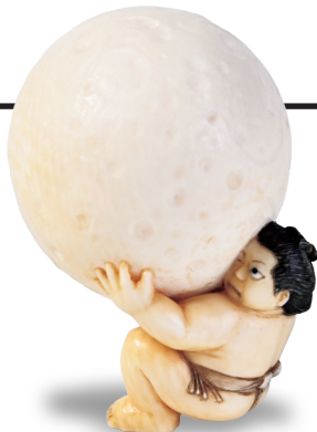
『 Sumo Wrestler Holding the Victory Star 』 YOKA (1968~) H5.0cm Sumo wrestlers were ranked on a star chart, with a white star as a win and a black star as a loss.