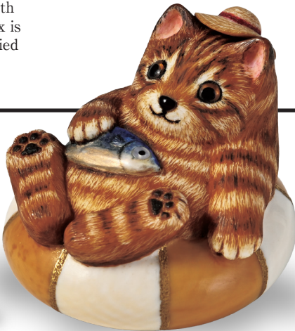
『 Delight 』 MIHO (1950~) H6.3cm Bathing in the sea in the summer is a delightful experience. Floating in the sea on a float is also a delight.