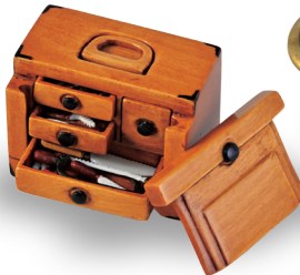
『 Netsuke Toolbox 』 TAKESHI (1940~) H3.0cm Miniature of a set of tools such as blades and saws used in netsuke. The drawers can actually be taken out.