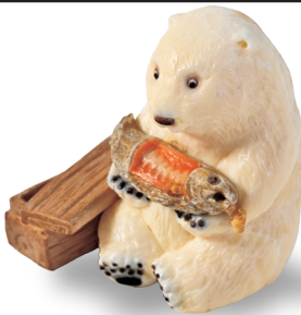
『 Year-end Gift 』 KENJI (1974~) H3.8cm In the past, Japan's year-end gift was salmon. The joke these days is that it reaches polar bears in the North Pole.