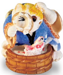
『 Oops! 』 YUKO (1967~) H3.2cm At a summer festival, a cat plays a game of scooping goldfish, but is laughed at by the goldfish