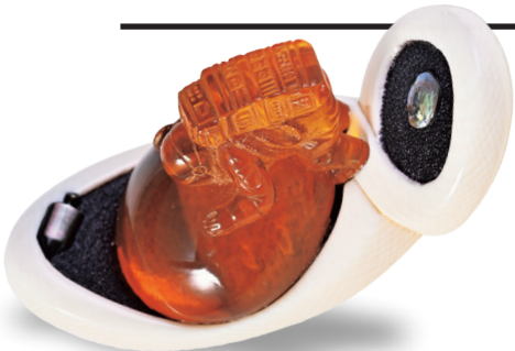
『 Impression 』 KIHO (1957~) H5.4cm The impression of landing on the moon for the first time is superimposed on the orbits of the planets and the Mobius rings.