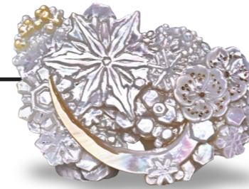
「 Beauty of the Seasons 』 AKEMI (1959~) H3.5cm The snow, moon, and flowers reflect the aesthetic sense of Japanese people who enjoy nature and the four seasons.