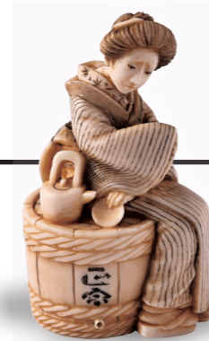
THE GOLDEN NETSUKE AWARDS GRAND PRIX 「 Drinking alone 』 MOTOMASA (1976~) H4.7cm A woman alone, feeling lonely because she had been dumped by a man, felt the taste of alcohol differently.