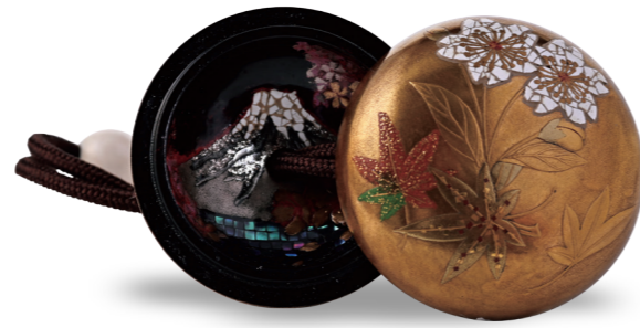
「 Spring and Fall 』 SHUKO (1954~) H3.7cm The mixture of cherry blossoms in spring and autumn leaves in fall reminds us of the passage of time.

In arts and crafts, the Japanese sense of beauty has developed its own unique style through bold asymmetrical compositions, superb detailing, and the symbolism of beauty in imperfection. In this month's exhibition, contemporary netsuke artists will introduce new works based on the theme of rediscovering the appeal of "Japanese beauty."