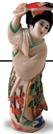
「 New Year's Day 』 DOSAI (1950~) H5.9cm Hagoita, a wooden racket, is used to wish for the growth and good health of girls.