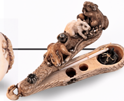
THE GOLDEN NETSUKE AWARDS AWARD OF EXCELLENCE 「 Balance scale with rats 』 TADATSUNA (1966~) H1.8cm The portable balance symbolizes commerce, and the rat is the messenger of Daikoku, inviting good fortune.