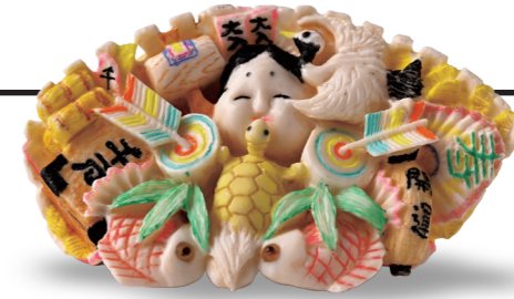
「 Rake for luck 』 YUKO (1852~) H3.6cm The Bamboo rake are gorgeously decorated with many lucky charms for prosperous business.