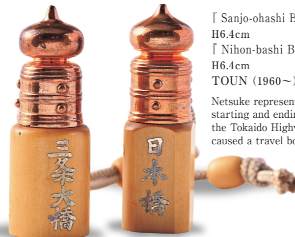
「 Sanjo-ohashi Bridge Sign 」 H6.4cm 「 Nihon-bashi Bridge Sign 」 H6.4cm TOUN (1960~)

Dosojin, placed at the village border as a guardian deity of the village, is the first to greet travelers.