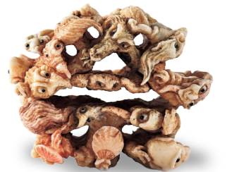
「 Festival of Apparitions 」 KIHO (1957~) H3.2cm

The awakening of Venus is superimposed on the emergence of a sublime new world.