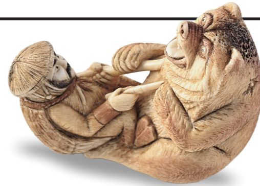
「 Bear Hunter 」 JIN (1956~) H4.8cm

A winning trick in sumo. This work carves out the moment of a wrestler's reversal of position.