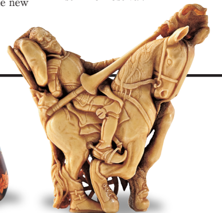
「 Don Quixote 」 ITARO (1961~) H5.7cm

The flowers and hummingbirds that bloom in this paradise of everlasting summer are a symbol of peace.