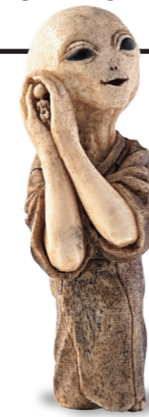
「 From Outer Space 」 IPPU (1970~) H6.0cm

The water nymphs in fairy tales test the integrity of humans with abilities beyond human understanding.