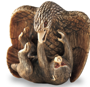
「 Eagle and Monkey 」 MEIGYOKUSAI (1896~1991) H3.6cm

A Fukusuke doll, which invites happiness, and a cat, which invites good fortune, are performing a boxing hook (Fuku).