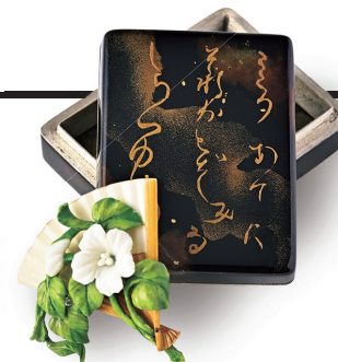
『 Yugao (Lady in the Tale of Genji) 』 AKIRA (1949~) H4.4cm A beautiful and thin-lived princess in the Tale of Genji.