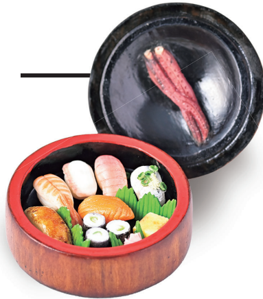
『 Sushi 』 JIN (1956~) H4.1cm Edo-mae sushi originated in the Edo period and is very popular today.

The one happiness that has remained unchanged in all times and places is a meal. The exhibition will feature netsuke based on culinary themes that add color and liveliness to everyday life. The abundance of natural ingredients has created a diverse food culture. Home cooking, in particular, has been handed down from generation to generation and becomes your own special memory. We have gathered together a collection of netsuke that evoke such scenes and memories.