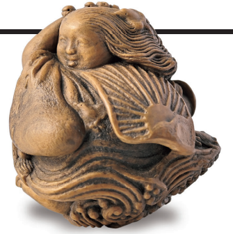
『 Laughter Invites Light 』 TOSHI (1957~) H4.3cm The dancing of the female deity brought light back from the dark world, along with laughter.