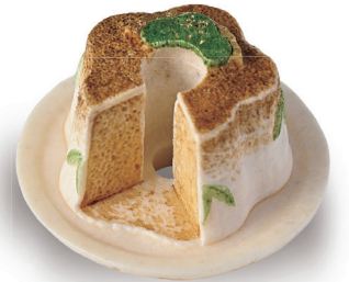
『 Special Day 』 IPPU (1970~) H4.2cm A cake that celebrates everyone's memorable special day.