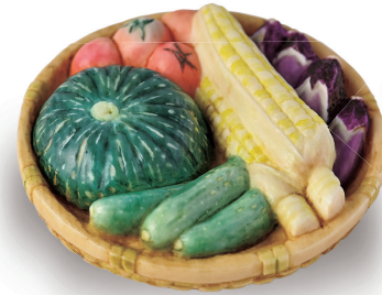
『 Basket of Vegetables 』 MIYABI (1977~) H4.2cm In the Yin-Yang Five Elements, vegetables were also divided into five colors.