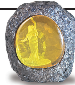
『 Amaterasu 』 KIHO (1957~) H3.5cm The world of mythology, reminiscent of the great eruptions of prehistoric times, is expressed on a dynamic scale.