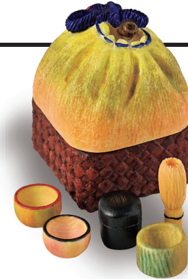
『 Tea Party 』 SHO (1972~) H4.2cm The Japanese tea ceremony was also held outdoors, and people loved the changing of the seasons.